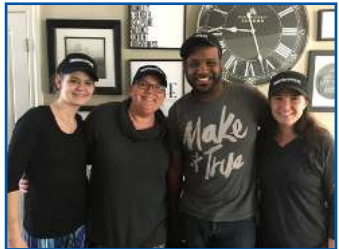
Attendees from Serenity Steps in Atlanta, GA during SMART Onsite Training.